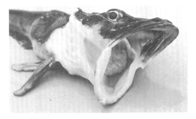
Figure 3. The head of Chaenocephalus aceratus, the most common icefish (Family Channichthyidae) in the Palmer Station area.

Figure 2. The spines of this Ctenocidaris collected near Arthur Harbor are heavily encrusted with other organisms, including sponges, coelenterates, ectoprocts, and ascidians. Such infestations are common on antarctic echinoids, especially cidaroids.